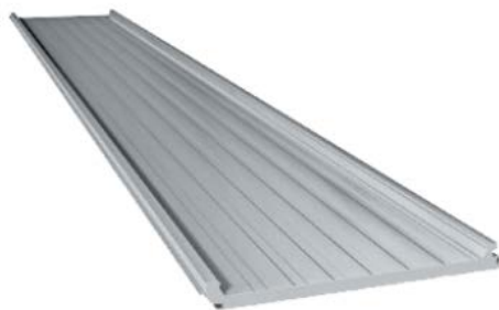
Figure 2: Example of Versapanel IMP product

IMPs are offered in a variety of profiles and sizes depending on the need of the project, as seen in Figure 4.